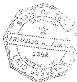
Exhibit "A" Attachment "II"